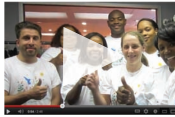
Watch the Con Edison volunteer video at Youtube.com/ConEdisonNY

Corporate Volunteer Groups are an integral part of Bottomless Closet. Groups shadow client appointments (dressing women and assisting with coaching for upcoming interviews) and help manage the boutique and inventory space. A big THANK YOU to the following: